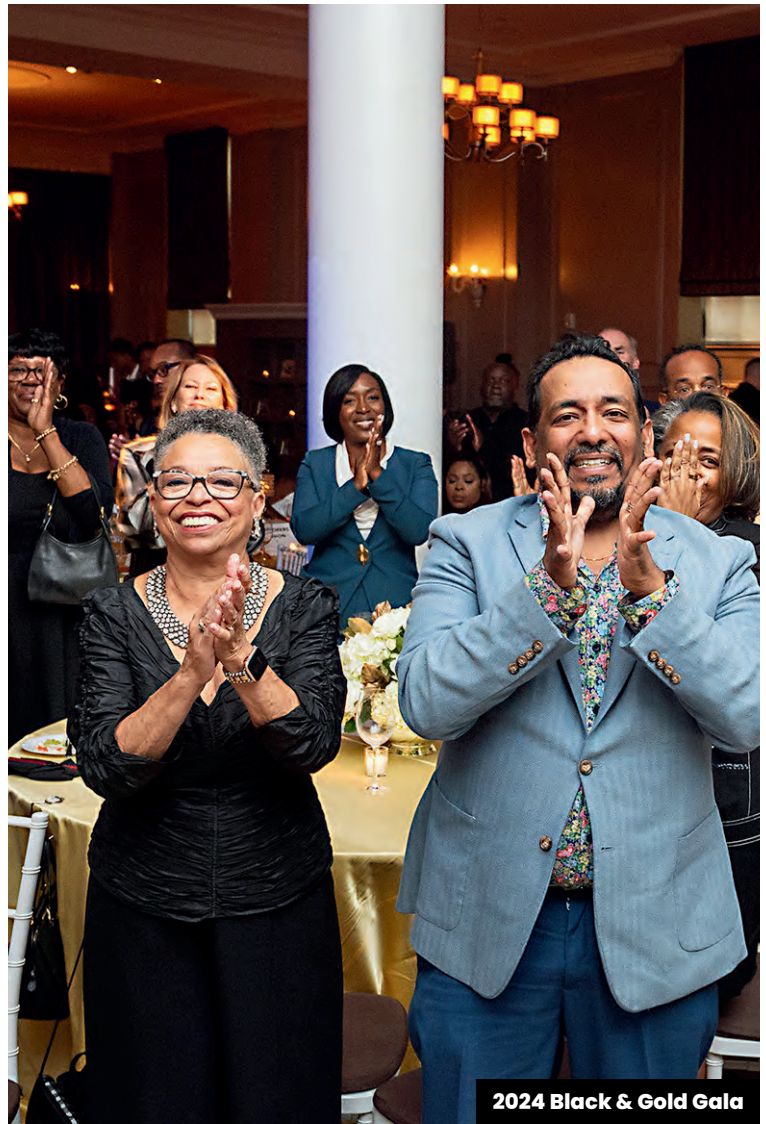
2024 Black & Gold Gala

One of the things that I like to say about the goal of my time as president of the Community College of Philadelphia Foundation is to transform the lives of Philadelphians and the city of Philadelphia through access to excellent education at the Community College of Philadelphia. We have an opportunity to really make a difference.